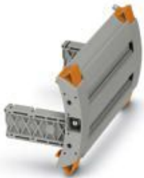
Dummy plug, pitch: 8.2 mm, length: 72.9 mm, width: 130.8 mm, number of positions: 12, color: gray

Please be informed that the data shown in this PDF Document is generated from our Online Catalog. Please find the complete data in the user's documentation. Our General Terms of Use for Downloads are valid ( http://phoenixcontact.com/download )