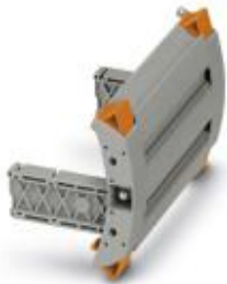
Dummy plug, color: gray

Please be informed that the data shown in this PDF Document is generated from our Online Catalog. Please find the complete data in the user's documentation. Our General Terms of Use for Downloads are valid ( http://phoenixcontact.com/download )