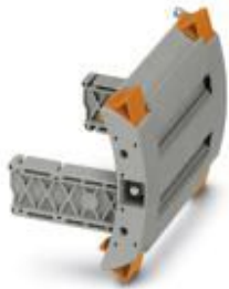
Dummy plug, color: gray

Please be informed that the data shown in this PDF Document is generated from our Online Catalog. Please find the complete data in the user's documentation. Our General Terms of Use for Downloads are valid ( http://phoenixcontact.com/download )