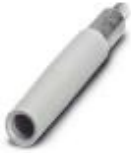
Female test connector, color: transparent

Female test connector - PSBJ-URTK 6 FARBLOS - 3026450