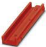
Coding profile, For UTWE 6-2 and UTRE 6-2 block, design: delta, length: 44.7 mm, width: 10.7 mm, height: 4.3 mm, color: red