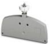
Cover profile carrier, width: 8 mm, height: 56.6 mm, material: PA, length: 80.9 mm, color: gray

Cover profile carrier - APH-UTWE 6-2 - 3069057