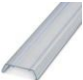
Cover profile, for covering terminal strips, directly snapped onto RBO... and RSC... test disconnect terminal blocks. Length supplied: 1 m