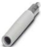
Female test connector, color: white

Female test connector - PSBJ-URTK 6 WH - 3026448