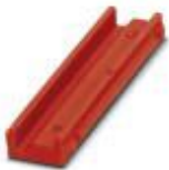
Coding profile, For UTWE 6-2 and UTRE 6-2 block, design: delta, length: 44.7 mm, width: 10.7 mm, height: 4.3 mm, color: red