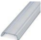
Cover profile, for covering terminal strips, directly snapped onto RBO... and RSC... test disconnect terminal blocks. Length supplied: 1 m