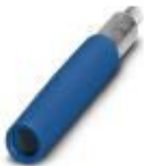
Female test connector, color: blue

Female test connector - PSBJ-URTK 6 BU - 3026434