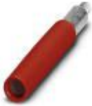
Female test connector, color: red

Female test connector - PSBJ-URTK 6 RD - 3026719