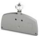
Cover profile carrier, width: 8 mm, height: 56.6 mm, material: PA, length: 80.9 mm, color: gray

Cover profile carrier - APH-UTWE 6-2 - 3069057