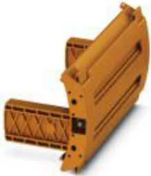
Dummy plug, color: orange

Please be informed that the data shown in this PDF Document is generated from our Online Catalog. Please find the complete data in the user's documentation. Our General Terms of Use for Downloads are valid ( http://phoenixcontact.com/download )