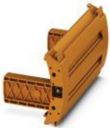
Dummy plug, color: orange

Please be informed that the data shown in this PDF Document is generated from our Online Catalog. Please find the complete data in the user's documentation. Our General Terms of Use for Downloads are valid ( http://phoenixcontact.com/download )