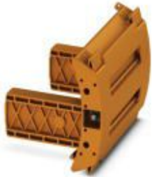
Dummy plug, color: orange

Please be informed that the data shown in this PDF Document is generated from our Online Catalog. Please find the complete data in the user's documentation. Our General Terms of Use for Downloads are valid ( http://phoenixcontact.com/download )