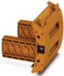
Dummy plug, color: orange

Please be informed that the data shown in this PDF Document is generated from our Online Catalog. Please find the complete data in the user's documentation. Our General Terms of Use for Downloads are valid ( http://phoenixcontact.com/download )