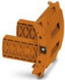
Dummy plug, color: orange

Please be informed that the data shown in this PDF Document is generated from our Online Catalog. Please find the complete data in the user's documentation. Our General Terms of Use for Downloads are valid ( http://phoenixcontact.com/download )