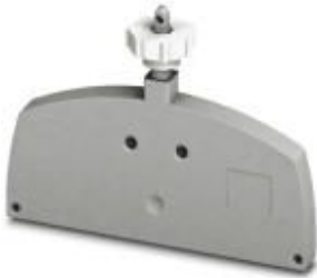
Cover profile carrier, width: 8 mm, height: 56.6 mm, material: PA, length: 80.9 mm, color: gray

Please be informed that the data shown in this PDF Document is generated from our Online Catalog. Please find the complete data in the user's documentation. Our General Terms of Use for Downloads are valid ( http://phoenixcontact.com/download )