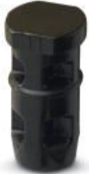
Filler plugs, length: 20 mm, diameter: 10 mm, color: black

Please be informed that the data shown in this PDF Document is generated from our Online Catalog. Please find the complete data in the user's documentation. Our General Terms of Use for Downloads are valid ( http://phoenixcontact.com/download )