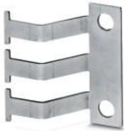
EMC cable catch rail

Please be informed that the data shown in this PDF Document is generated from our Online Catalog. Please find the complete data in the user's documentation. Our General Terms of Use for Downloads are valid ( http://phoenixcontact.com/download )