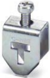
Busbar connector for fixing the busbar to the NLS 3/10 AV 134/134 angled rail

Please be informed that the data shown in this PDF Document is generated from our Online Catalog. Please find the complete data in the user's documentation. Our General Terms of Use for Downloads are valid ( http://phoenixcontact.com/download )