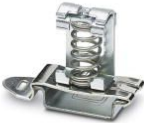
Shield connection terminal block, for applying the shield to busbars

Please be informed that the data shown in this PDF Document is generated from our Online Catalog. Please find the complete data in the user's documentation. Our General Terms of Use for Downloads are valid ( http://phoenixcontact.com/download )