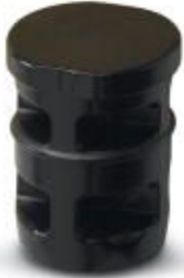
Filler plugs, length: 20 mm, diameter: 16 mm, color: black

Please be informed that the data shown in this PDF Document is generated from our Online Catalog. Please find the complete data in the user's documentation. Our General Terms of Use for Downloads are valid ( http://phoenixcontact.com/download )