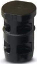
Filler plugs, length: 20 mm, diameter: 13 mm, color: black

Please be informed that the data shown in this PDF Document is generated from our Online Catalog. Please find the complete data in the user's documentation. Our General Terms of Use for Downloads are valid ( http://phoenixcontact.com/download )