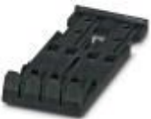
Strain relief, length: 48.7 mm, width: 19.6 mm, number of positions: 4, color: black