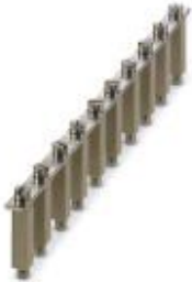
Fixed bridge, pitch: 13 mm, number of positions: 10, color: silver

Please be informed that the data shown in this PDF Document is generated from our Online Catalog. Please find the complete data in the user's documentation. Our General Terms of Use for Downloads are valid ( http://phoenixcontact.com/download )