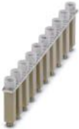
Fixed bridge, pitch: 9 mm, number of positions: 10, color: silver

Please be informed that the data shown in this PDF Document is generated from our Online Catalog. Please find the complete data in the user's documentation. Our General Terms of Use for Downloads are valid ( http://phoenixcontact.com/download )