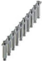
Fixed bridge, pitch: 13 mm, number of positions: 10, color: silver

Please be informed that the data shown in this PDF Document is generated from our Online Catalog. Please find the complete data in the user's documentation. Our General Terms of Use for Downloads are valid ( http://phoenixcontact.com/download )