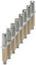
Fixed bridge, with knurled screws, pitch: 13 mm, number of positions: 8, color: silver

Please be informed that the data shown in this PDF Document is generated from our Online Catalog. Please find the complete data in the user's documentation. Our General Terms of Use for Downloads are valid ( http://phoenixcontact.com/download )