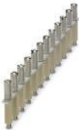
Fixed bridge, with knurled screws, pitch: 13 mm, number of positions: 12, color: silver

Please be informed that the data shown in this PDF Document is generated from our Online Catalog. Please find the complete data in the user's documentation. Our General Terms of Use for Downloads are valid ( http://phoenixcontact.com/download )