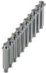
Fixed bridge, pitch: 9 mm, number of positions: 10, color: silver

Please be informed that the data shown in this PDF Document is generated from our Online Catalog. Please find the complete data in the user's documentation. Our General Terms of Use for Downloads are valid ( http://phoenixcontact.com/download )