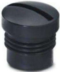
Fuse holder, sleeve length: 13.2 mm, length: 22.5 mm, diameter: 11 mm, color: black

Please be informed that the data shown in this PDF Document is generated from our Online Catalog. Please find the complete data in the user's documentation. Our General Terms of Use for Downloads are valid ( http://phoenixcontact.com/download )