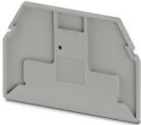
End cover, length: 53.3 mm, width: 2.2 mm, height: 37 mm, color: gray

Please be informed that the data shown in this PDF Document is generated from our Online Catalog. Please find the complete data in the user's documentation. Our General Terms of Use for Downloads are valid ( http://phoenixcontact.com/download )