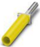
Female test connector, color: yellow

Female test connector - PSBJ-URTK/S YE - 0311731