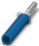
Female test connector, color: blue

Female test connector - PSBJ-URTK/S BU - 0311757