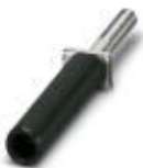
Female test connector, color: black

Female test connector - PSBJ-URTK/S BK - 0311728