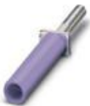
Female test connector, color: violet

Female test connector - PSBJ-URTK/S VT - 0311773