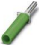
Female test connector, color: green

Female test connector - PSBJ-URTK/S GN - 0311760