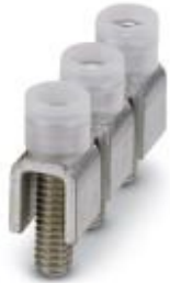
Fixed bridge, with Allen screws and SW 4 (wrench size), number of positions: 3, color: silver

Please be informed that the data shown in this PDF Document is generated from our Online Catalog. Please find the complete data in the user's documentation. Our General Terms of Use for Downloads are valid ( http://phoenixcontact.com/download )