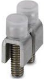
Fixed bridge, with Allen screws and SW 4 (wrench size), number of positions: 2, color: silver

Please be informed that the data shown in this PDF Document is generated from our Online Catalog. Please find the complete data in the user's documentation. Our General Terms of Use for Downloads are valid ( http://phoenixcontact.com/download )