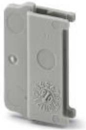
Path extension, color: gray

Please be informed that the data shown in this PDF Document is generated from our Online Catalog. Please find the complete data in the user's documentation. Our General Terms of Use for Downloads are valid ( http://phoenixcontact.com/download )