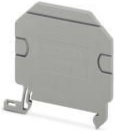
Partition plate, length: 53.4 mm, width: 2.2 mm, height: 45.7 mm, color: gray

Please be informed that the data shown in this PDF Document is generated from our Online Catalog. Please find the complete data in the user's documentation. Our General Terms of Use for Downloads are valid ( http://phoenixcontact.com/download )