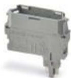
Component connector, for installing components that can be individually selected up to a diameter of 10 mm and power dissipation of up to 1 W, nominal current: 10 A, length: 41.2 mm, width: 12.3 mm, height: 37.5 mm, number of positions: 1, color: gray

Component connector - P-CO XL-UT - 3036799