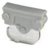
Feed-through connector, length: 10.5 mm, width: 4 mm, color: gray

Feed-through connector - P-FIX - 3038956