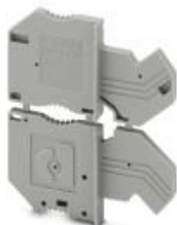
End cover, Right / left, length: 49.4 mm, width: 5 mm, height: 26.9 mm, color: gray

Please be informed that the data shown in this PDF Document is generated from our Online Catalog. Please find the complete data in the user's documentation. Our General Terms of Use for Downloads are valid ( http://phoenixcontact.com/download )