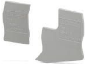
Cover segment, length: 72 mm, height: 36.5 mm, color: gray

Please be informed that the data shown in this PDF Document is generated from our Online Catalog. Please find the complete data in the user's documentation. Our General Terms of Use for Downloads are valid ( http://phoenixcontact.com/download )