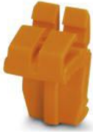
Latching, length: 15.8 mm, width: 10 mm, number of positions: 2, color: orange

Please be informed that the data shown in this PDF Document is generated from our Online Catalog. Please find the complete data in the user's documentation. Our General Terms of Use for Downloads are valid ( http://phoenixcontact.com/download )