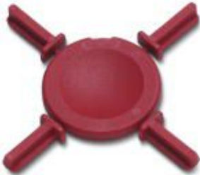
Coding star, length: 3 mm, width: 3 mm, height: 6 mm, color: red

Please be informed that the data shown in this PDF Document is generated from our Online Catalog. Please find the complete data in the user's documentation. Our General Terms of Use for Downloads are valid ( http://phoenixcontact.com/download )