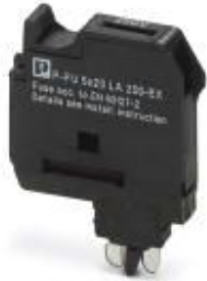
Fuse plug, nominal current: 6.3 A, nom. voltage: 500 V, width: 6.2 mm, fuse type: G / 5 x 20, color: black

Please be informed that the data shown in this PDF Document is generated from our Online Catalog. Please find the complete data in the user's documentation. Our General Terms of Use for Downloads are valid ( http://phoenixcontact.com/download )