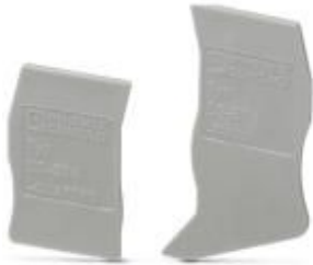
Cover segment, length: 87 mm, height: 36.5 mm, color: gray

Please be informed that the data shown in this PDF Document is generated from our Online Catalog. Please find the complete data in the user's documentation. Our General Terms of Use for Downloads are valid ( http://phoenixcontact.com/download )