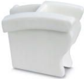
Switching lock, length: 12 mm, width: 6.2 mm, color: white

Please be informed that the data shown in this PDF Document is generated from our Online Catalog. Please find the complete data in the user's documentation. Our General Terms of Use for Downloads are valid ( http://phoenixcontact.com/download )