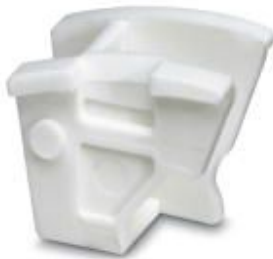
Switching lock, length: 12 mm, width: 8.2 mm, color: white

Please be informed that the data shown in this PDF Document is generated from our Online Catalog. Please find the complete data in the user's documentation. Our General Terms of Use for Downloads are valid ( http://phoenixcontact.com/download )