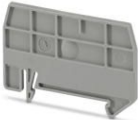
Partition plate, length: 59.8 mm, width: 2 mm, height: 39 mm, color: gray

Please be informed that the data shown in this PDF Document is generated from our Online Catalog. Please find the complete data in the user's documentation. Our General Terms of Use for Downloads are valid ( http://phoenixcontact.com/download )