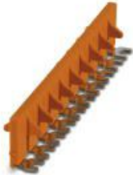
Switching jumper, pitch: 8.2 mm, width: 80.9 mm, number of positions: 10, color: orange

Please be informed that the data shown in this PDF Document is generated from our Online Catalog. Please find the complete data in the user's documentation. Our General Terms of Use for Downloads are valid ( http://phoenixcontact.com/download )