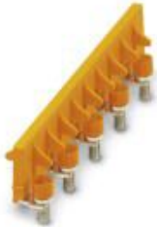
Switching jumper, pitch: 8.2 mm, number of positions: 10, color: orange

Please be informed that the data shown in this PDF Document is generated from our Online Catalog. Please find the complete data in the user's documentation. Our General Terms of Use for Downloads are valid ( http://phoenixcontact.com/download )