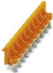
Switching jumper, pitch: 8.2 mm, width: 80.9 mm, number of positions: 10, color: orange

Please be informed that the data shown in this PDF Document is generated from our Online Catalog. Please find the complete data in the user's documentation. Our General Terms of Use for Downloads are valid ( http://phoenixcontact.com/download )