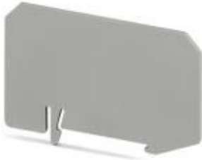
Partition plate, length: 73.5 mm, width: 2 mm, height: 47.2 mm, color: gray

Please be informed that the data shown in this PDF Document is generated from our Online Catalog. Please find the complete data in the user's documentation. Our General Terms of Use for Downloads are valid ( http://phoenixcontact.com/download )