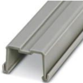
Cover profile, length: 1 m

Please be informed that the data shown in this PDF Document is generated from our Online Catalog. Please find the complete data in the user's documentation. Our General Terms of Use for Downloads are valid ( http://phoenixcontact.com/download )