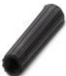
Insulating sleeve, color: black