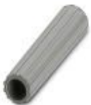
Insulating sleeve, color: gray