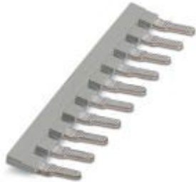
Insertion bridge, pitch: 12 mm, number of positions: 10, color: gray

Please be informed that the data shown in this PDF Document is generated from our Online Catalog. Please find the complete data in the user's documentation. Our General Terms of Use for Downloads are valid ( http://phoenixcontact.com/download )