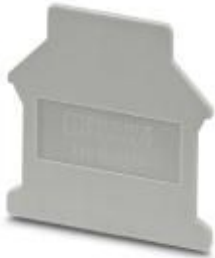
End cover, length: 42.5 mm, width: 1.5 mm, height: 54 mm, color: gray

Please be informed that the data shown in this PDF Document is generated from our Online Catalog. Please find the complete data in the user's documentation. Our General Terms of Use for Downloads are valid ( http://phoenixcontact.com/download )